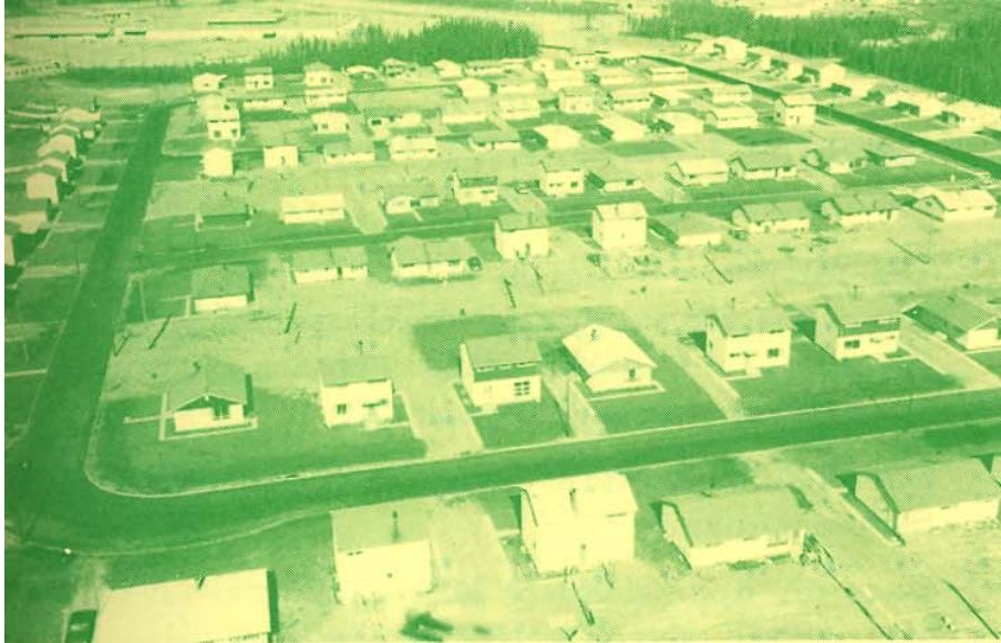
AERIAL VIEW OF TOWNSITE AREA