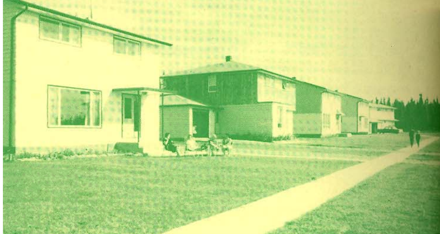
A THOMPSON RESIDENTIAL STREET